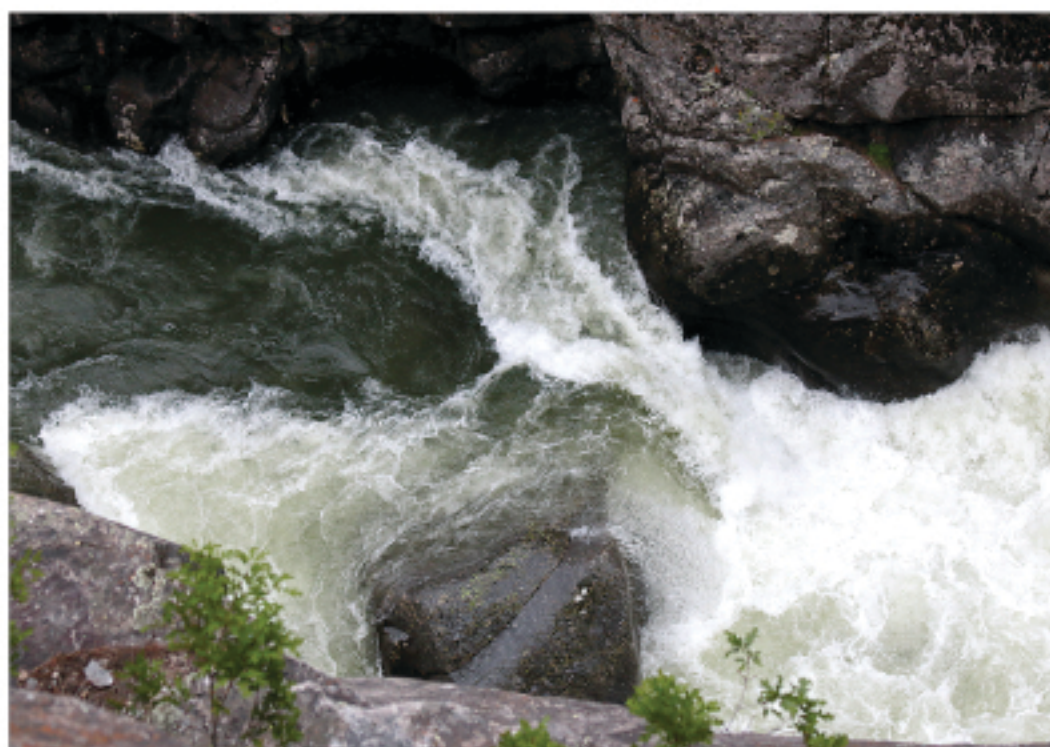
Vallecito Creek running high.