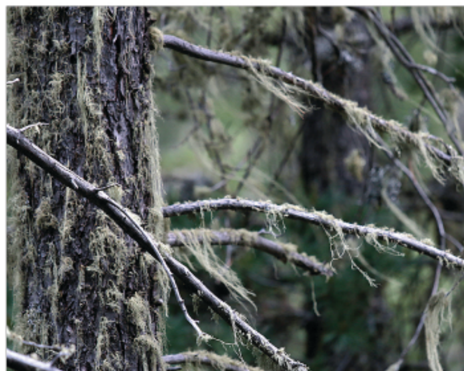
Spanish moss lends a rainforest feel.