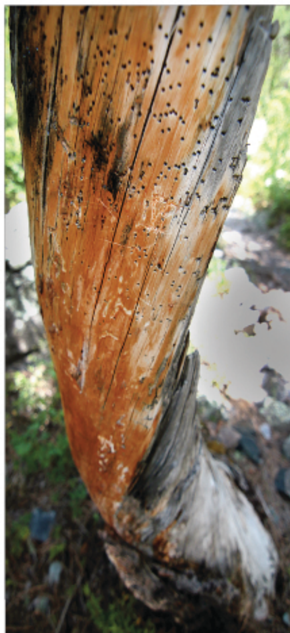
Mother Natures' sculpture.

retreat, to escape the bustle and heat of the city. For some it's lounging in the back yard with a beer, for others it's a favorite trail into the Weminuche or a hike along a bubbling stream. For many, it's both. So pack up a few cold ones and hit your favorite wilderness route. It's sure to revive your love of summer, at least until you have to wait in another line.