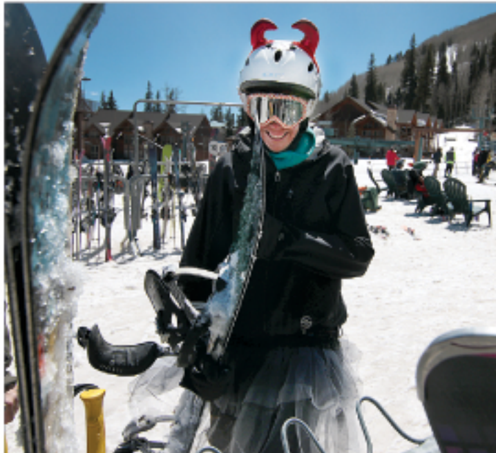
Tutus: a great all-season approach to Durango costumery