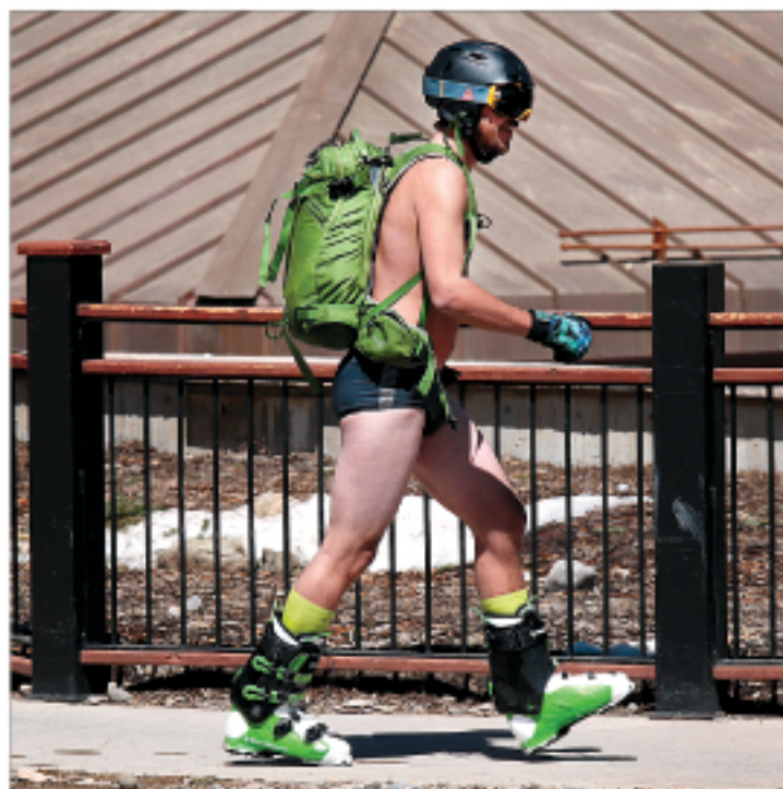
Strutting the ski-do and possibly some interesting tan lines