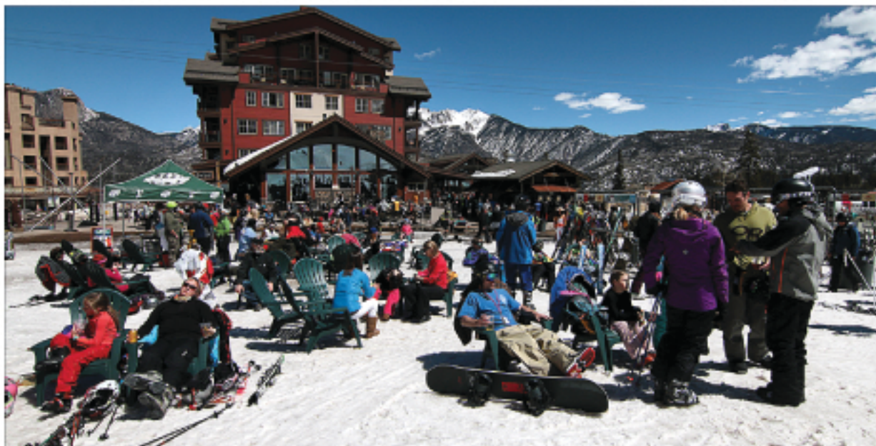
End-of-season sun bathing is taken very seriously at the beach.