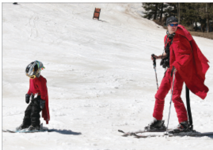
A devilish duo does Demon.