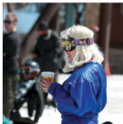
These folks didn't get the angel and demon memo but are fashionably winning nonetheless.