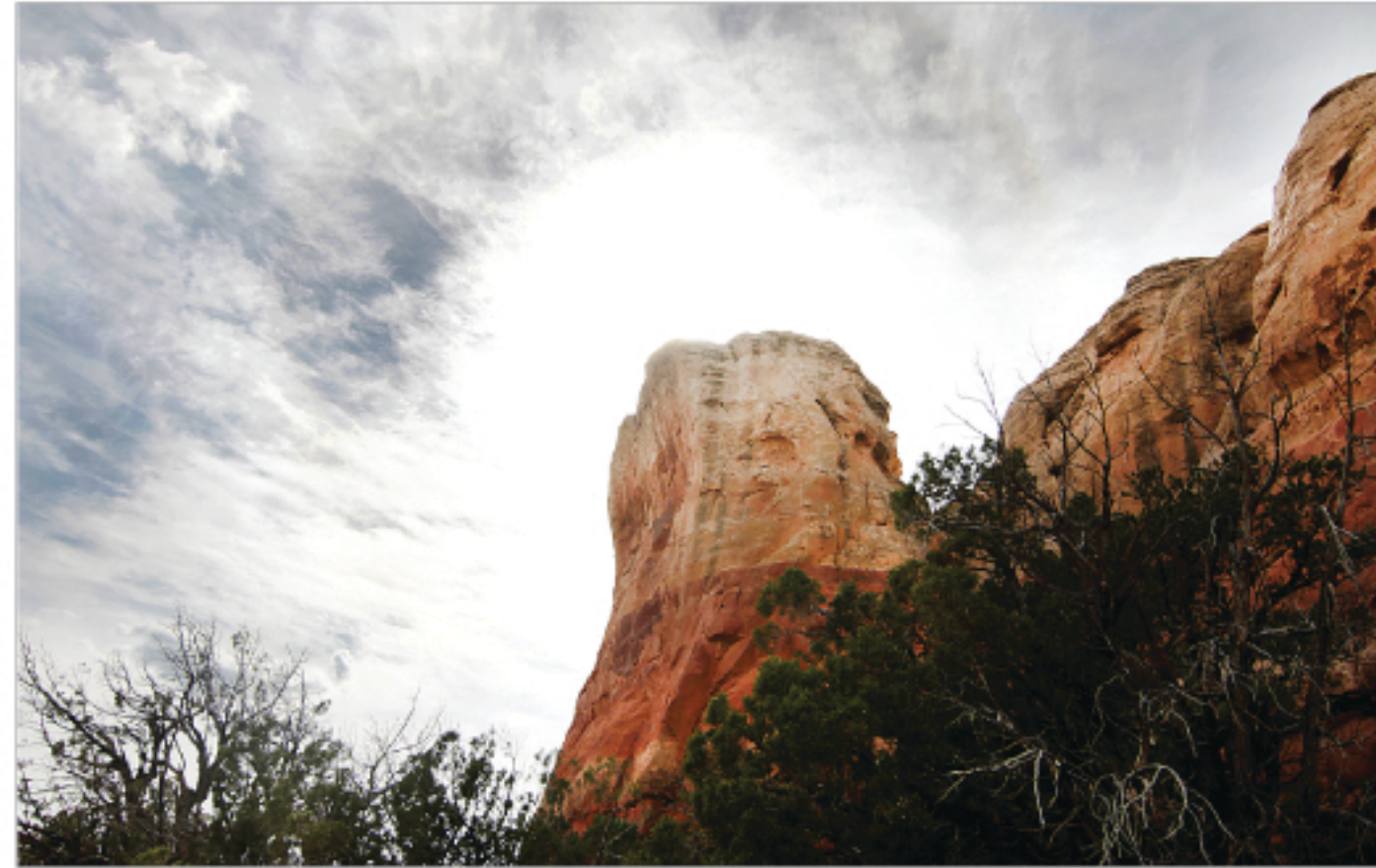
A thin cloud cover and the afternoon sun conspire to create a halo effect over this sandstone spire.