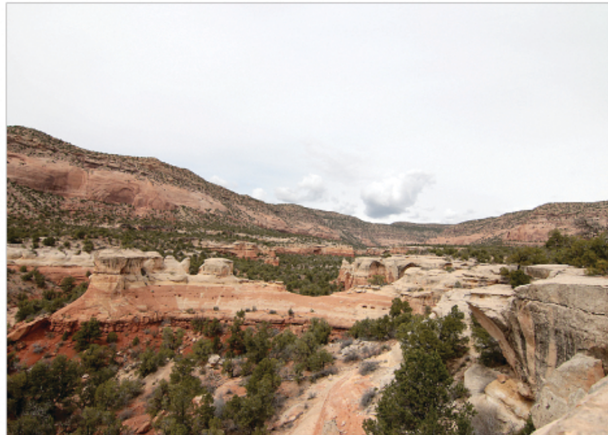
Classic Southwest Colorado vistas await behind virtually every a canyon wall.