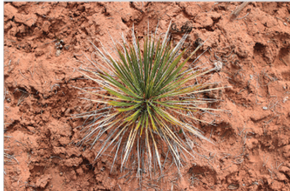
Green flora creates a nice contrast to the muted earthtones.