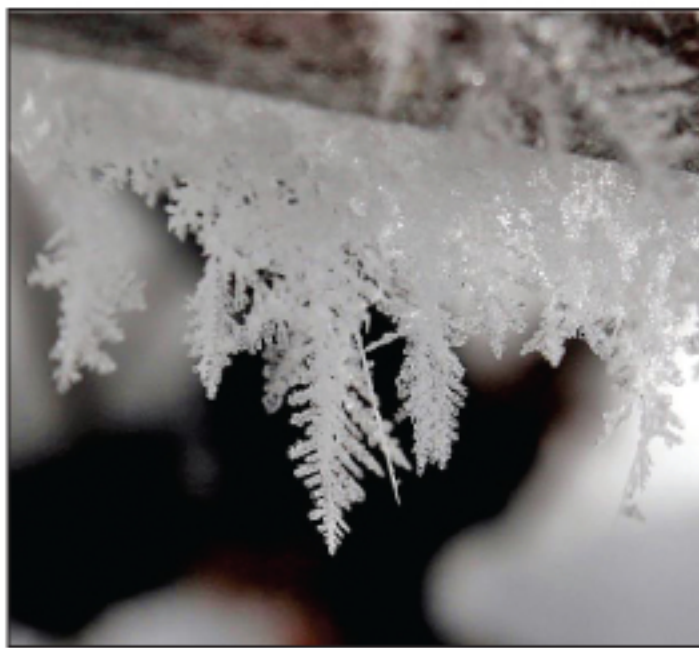
A delicate frosting of hoar feathers cling to a tree.