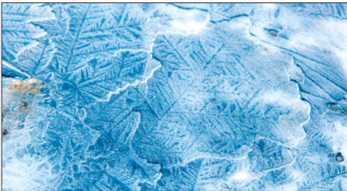
Intricate patterns of ice glaze over a sidewalk in downtown Durango.