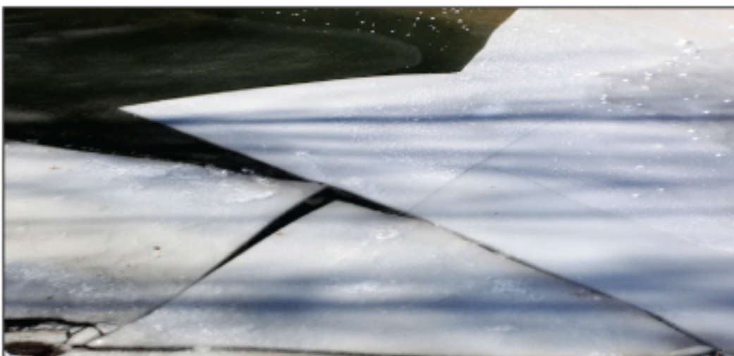
Plates of ice bob along the banks of the Animas River.