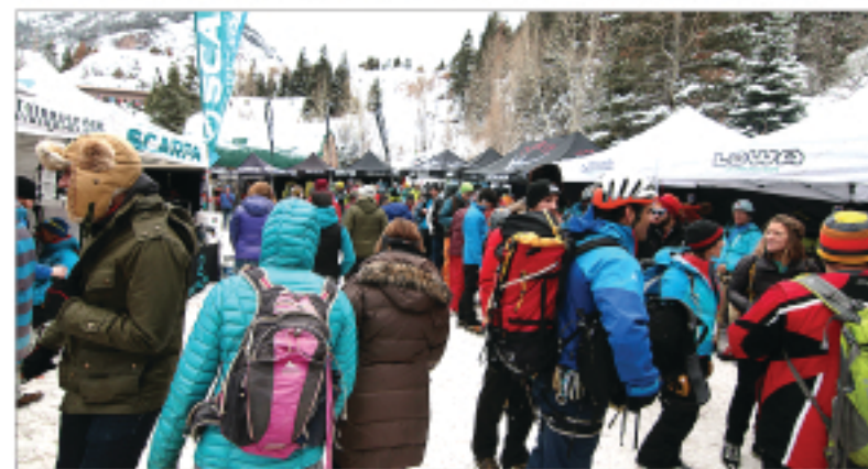
Large crowds flock the outdoor retailer tents for free stuff and warm beverages.