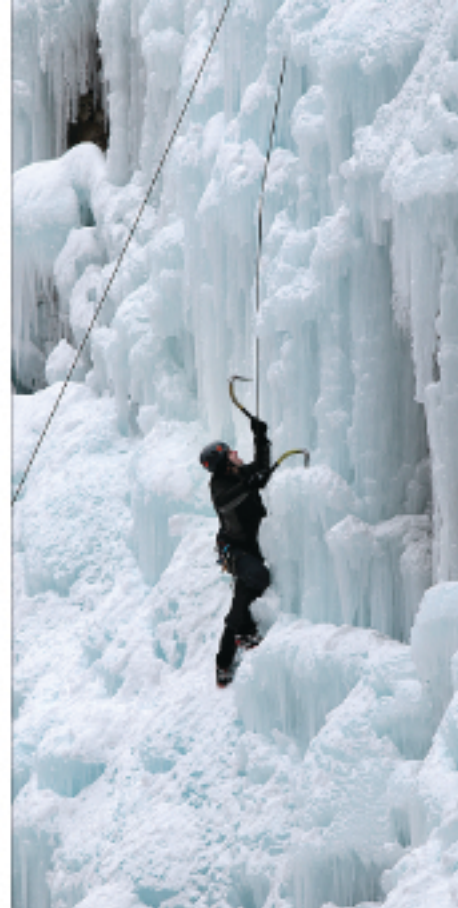
Using metal picks to propel oneself up an ice wall is no easy task.

The Ouray Ice Park is not just a sightseer's marvel, but an ice climber's mecca. Each winter, with the aid of water from the City of Ouray, a group of so-called "Ice Farmers" create more than 200 manmade icefalls along a mile-long stretch through the Uncompahgre Gorge. At this year's Ouray Ice Festival, held Jan. 16-17, the pros made scaling these 40-foot walls of ice look easy. Coming from all over the world, with a few hailing closer to home, climbers competed in elite mixed-climbing as well as speed-climbing competitions. And for those who fall somewhere between the elite and weekend warrior ranks, the festival offered plenty of gear demos, clinics, great schwag and late night parties for when it was time to go inside and warm up.