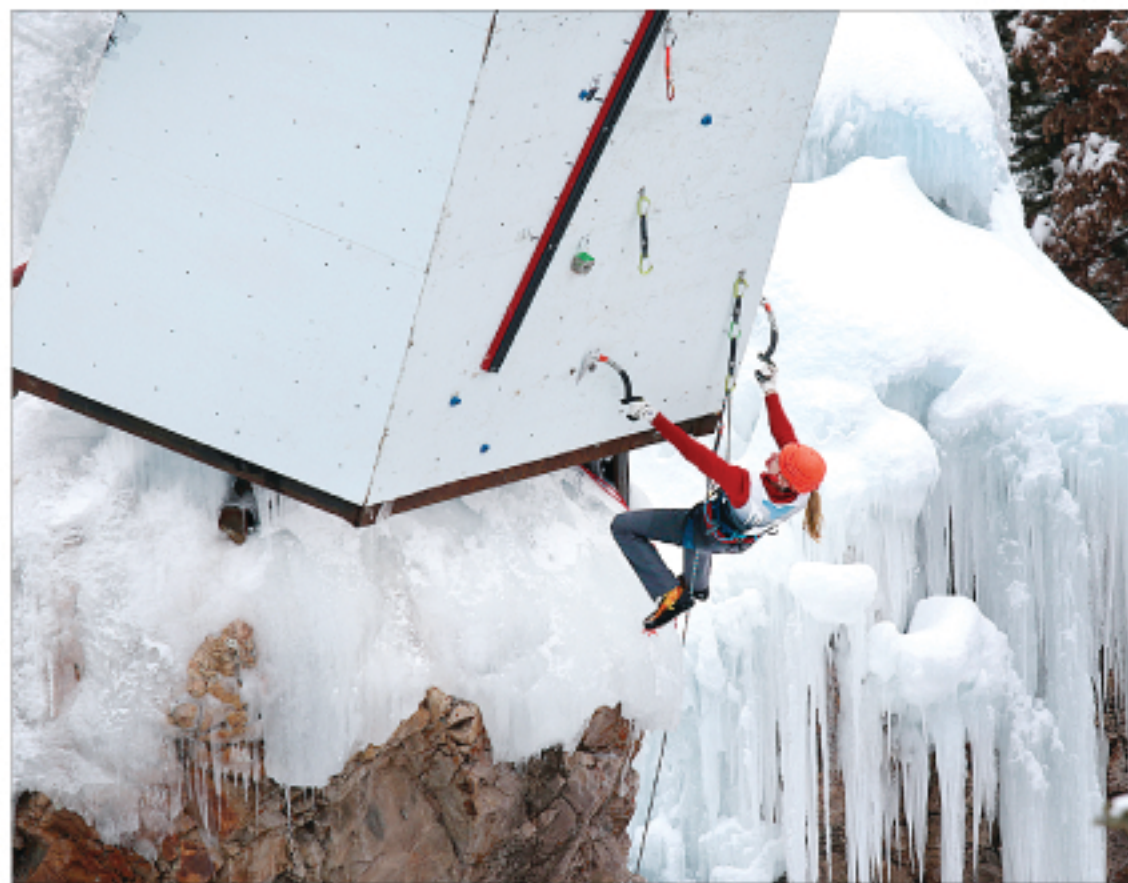
A female competitor nearing the finish of the elite mixed-climbing route on Saturday.