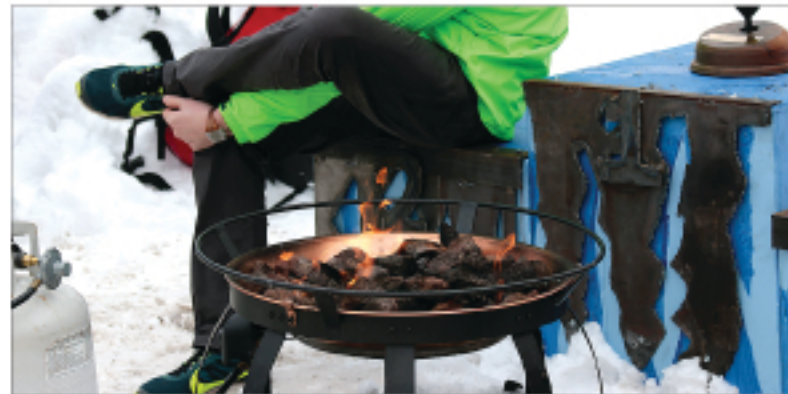
Defrosting by the fire was a popular activity when not on the wall.