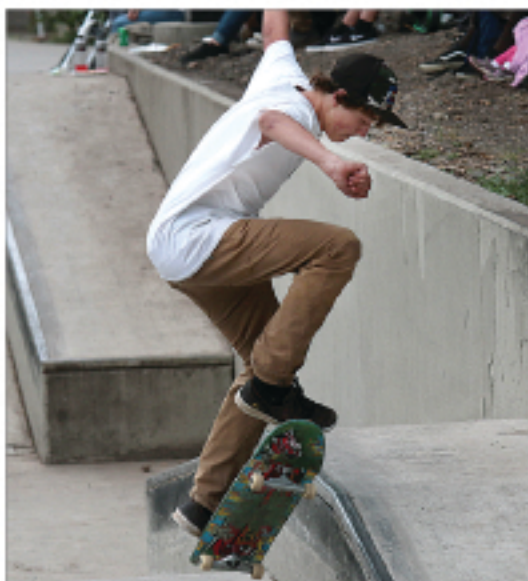
Showing off skills during the trick portion of Thursday's competition.