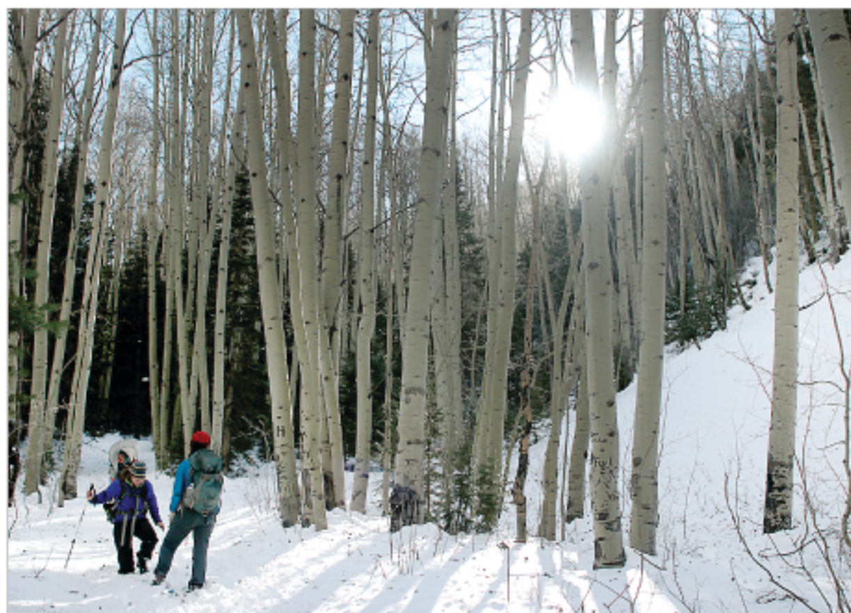
Taking a break to admire the solitude in La Plata Canyon.