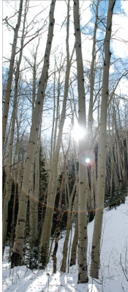
Fall sun peaks through an aspen grove.

As soon as the snow begins to fall, Durangoans dust off their winter toys, pull on the Gore-tex, and load up Sparky and the kids in search of the season's first snowy expedition. La Plata Canyon never fails to deliver when it comes to finding a winter wonderland close to home, whether it be a leisurely snowshoe on the road or a lung busting skin uphill in search of untracked turns. So even if it still looks like fall in the lowlands, remember, a complete change of seasons is only a short drive down, or up, the road. It's part of the beauty of calling this land, poised perfectly between mountain and desert, home.